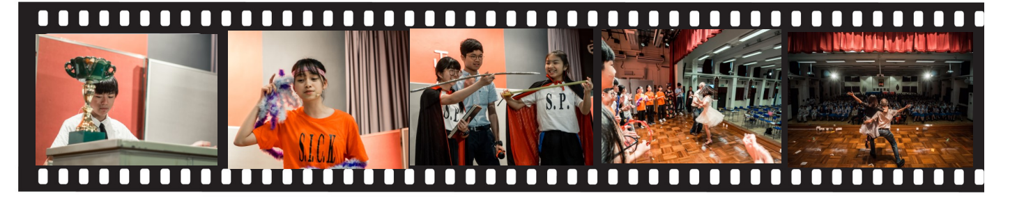
The taste of failure may be bitter, yet the glitter of our team is shining bright! We tried our best, did our best. Now, we are all winners!