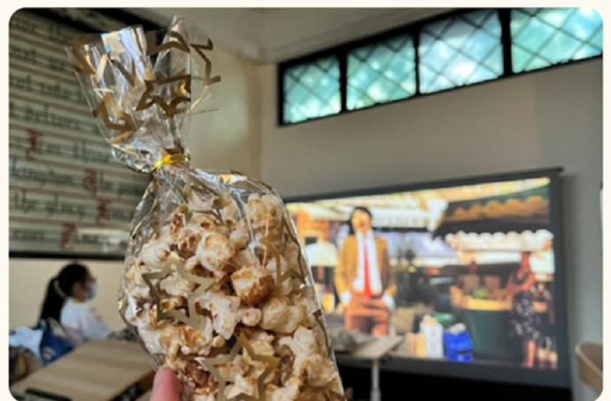
Cinematic Delight: Our film enthusiasts indulge in a movie experience complete with popcorn delights.