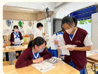
What would you like to eat or drink? Tell your classmates!