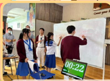
Healthy Competition: Classes engage in friendly English language skills challenges and quizzes.