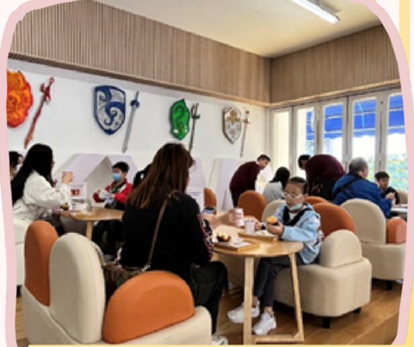
Café Delight: Guests indulge in delectable treats at our English Café, served by our dedicated students.

The English department prepared an English café experience during the school's Information Day, with the assistance of the English Ambassador Team (EAT) and other volunteering students. The event was a resounding success. The menu featured delectable treats such as Swiss rolls and muffins, complemented by a selection of tea options for our guests to enjoy. Additionally, attendees had the opportunity to engage in handicraft activities either before or after their refreshments.