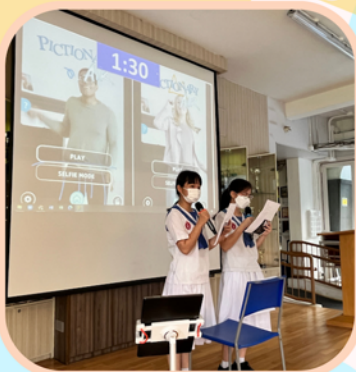
Empowering Eloquence: English Ambassadors engage students with interactive language games during recess.

English Ambassador Team (EAT) organizes recess games every day for students to test and sharpen their use of English language in the most fun ways possible.