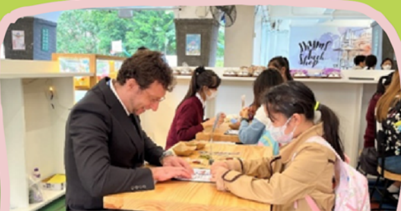
Crafting Smiles: Our dedicated teacher guiding a guest in the art of friendship bracelets.