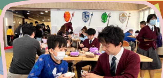
Creative Collaboration: A wholesome collaboration as our student guides our visitor to craft a charming towel teddy bear.