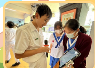
Building Leaders: The English Ambassadors grow their public speaking confidence and leadership skills while guiding learners through the English recess games.