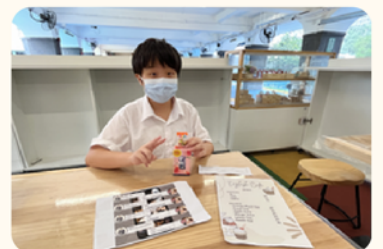
This is the look of a happy customer – enjoy your food during class time!