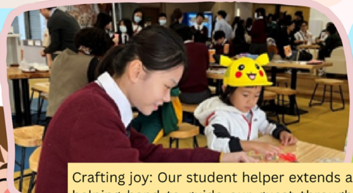
Crafting joy: Our student helper extends a helping hand to guide our guest through the art of creating a beautiful friendship bracelet.