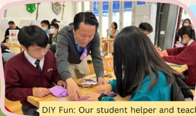
DIY Fun: Our student helper and teacher helping a guest to create a towel teddy bear.

Overall, the English café served as a delightful and engaging experience, showcasing the department's commitment to fostering a welcoming and inclusive environment while celebrating the diverse elements of the English language and culture. Such initiatives not only enrich the school's events but also contribute to the vibrant variety of experiences that the school community cherishes.