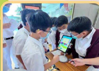
Teamwork Triumph: Our learners strengthen collaboration skills by tackling quizzes and challenges together during recess.