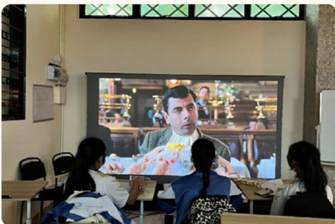
Unraveling films: LKYMS Film Club members and their teachers analyse movies through character analysis, discussions and more.

To elevate the cinematic experience, the students are treated with delicious sweet popcorn during the film club sessions, adding an element of enjoyment and festivity to the language learning experience. The film club is still taking members. Contact the teachers-in-charge for more details.