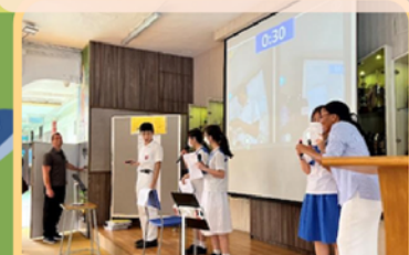
Quick thinking Mastering: Empowering learners to think on their feet and excel in spontaneous quiz challenges.