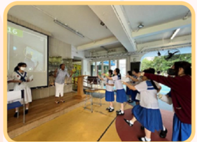
Empowering Voices: Teachers encourage the students to speak and be confident during the recess activities.

The students are rewarded for their performance by stamps in their English Passports, as well as accumulative scores for the entire classes on the board as they compete against each other.