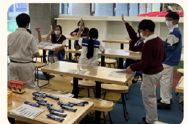
Are you hungry? Raise your hand and our LKYMS waiters will serve you!